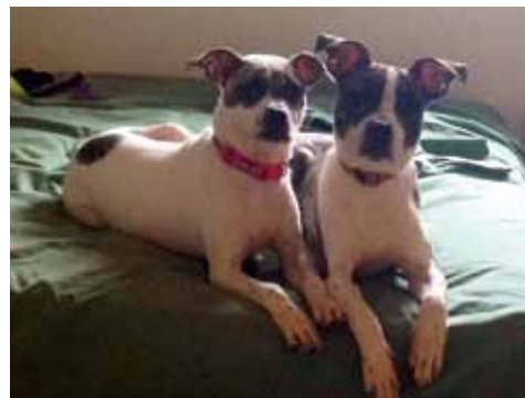
Tommy and Tammy - Before and After