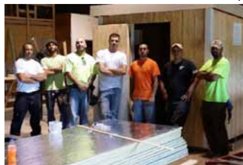
Empire State Carpenter's Apprenticeship Committee

cated freestanding generator and electric heat, the new residents will be safe and warm, even when power is lost in a storm.